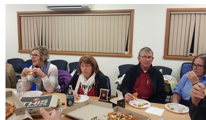
More from the SES visit