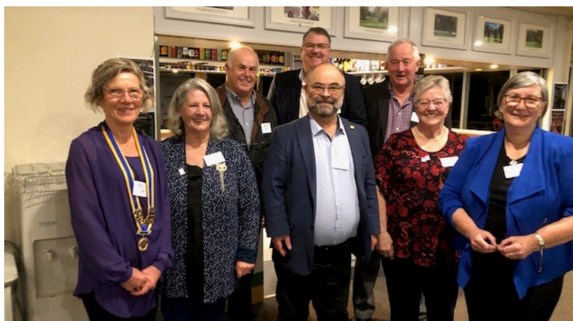
The new Board for 2023-24