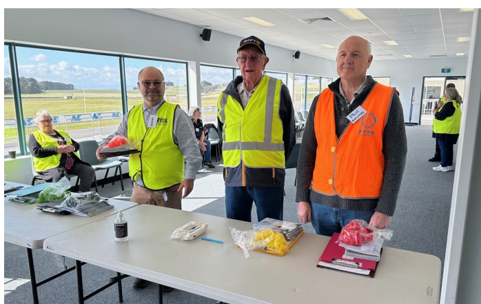
RYDA 2023 at Symmons Plains.